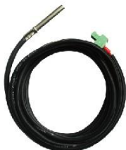
RTS300R47K3.81A Remote temperature sensor (3m)